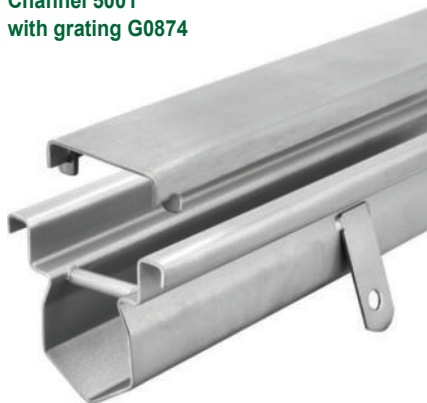
Channel 5001 with grating G0874

Total Hygienic DESIGN grating - satin finished closed grating with TWO SIDE SLOTS OF 5 mm h 20 mm, without frame ANTISEPTIC - LIGHT DUTY LOAD CLASS A15