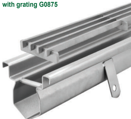
Channel 5001 with grating G0875

Total Hygienic MULTI-SLOT DESIGN grating without frame, mesh 8x160 mm h 20 mm ANTISEPTIC MEDIUM DUTY LOAD CLASS B125