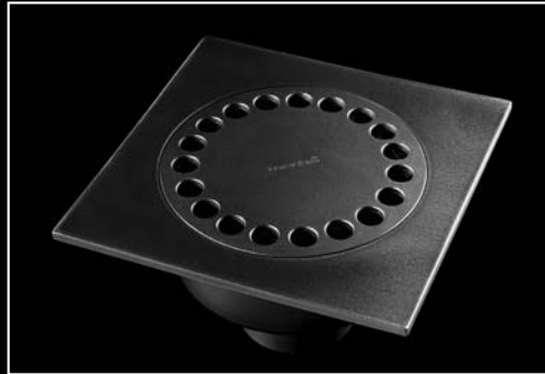
FLOOR DRAINS WITH SQUARE TOP PLATE