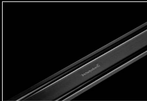
"ITALIA" CHANNELS WITH DOUBLE SLOT