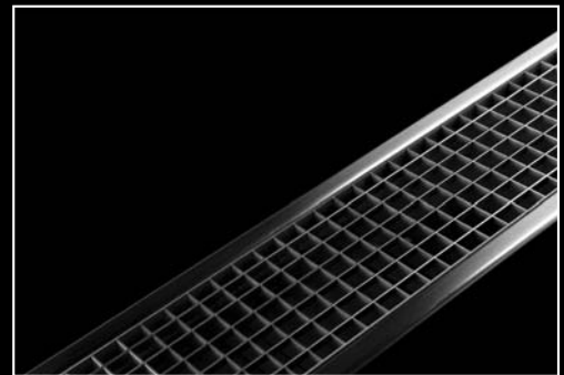
CHANNELS WITH GRATING