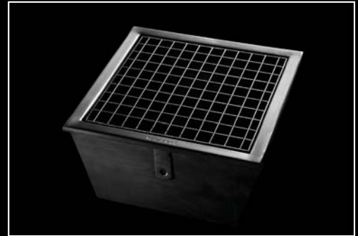
GULLIES WITH GRATING