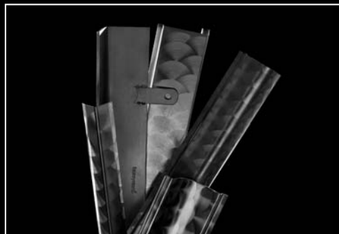
CORNER GUARDS AND FLOOR PROTECTION EDGES